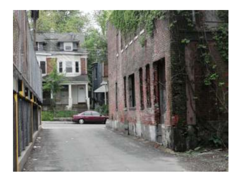
Derelict Building at Rear