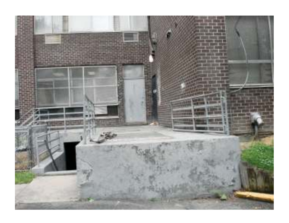
Rear Side of Building