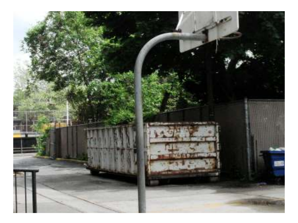
Dumpster & Part of Basketball Court