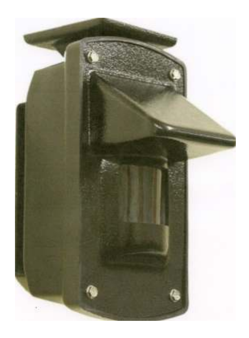
Future Sentry Solar Powered Wireless PIR Sensor

The wireless sensor can be mounted virtually anywhere provided there is reasonable access to sunlight for minimal periods. It has been proven that exposing the wireless sensor unit to six hours of sunlight, will allow the solar charged battery to operate the unit for a minimum period of 80 days.