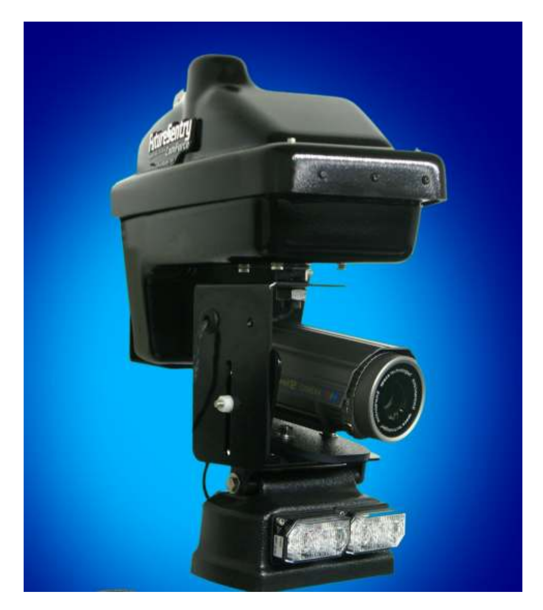
Manufacturer's Photo of Typical Tracking Platform Equipped with Non-Panasonic Analog Camera

The automated tracking platform is shown above and it should be noted that the platform has its own IP Address. The platform unit is weatherproof.